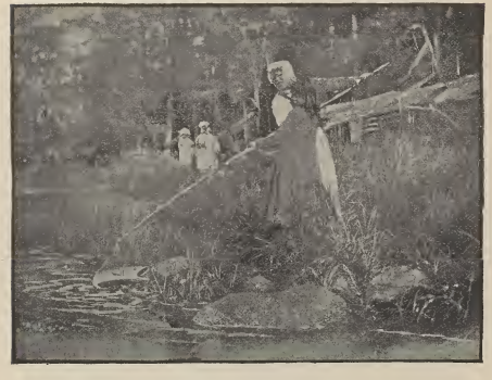
KLINGET GIRLS GAFFING SALMON.

Occupying the extreme northern section of Lynn Canal and the valleys of the Chilkat and Chilkot Rivers, is the Chilkat tribe, numbering 68s. They are great traders, being the "middle men" of their region, carrying the goods of commerce to the interior and exchanging them for furs, which are brought to the